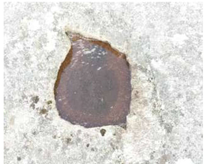
Approximately 25cm in diameter